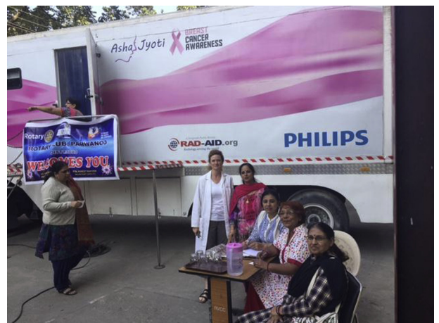
Figure 3. Asha Jyoti mobile imaging van, Chandigarh, India.